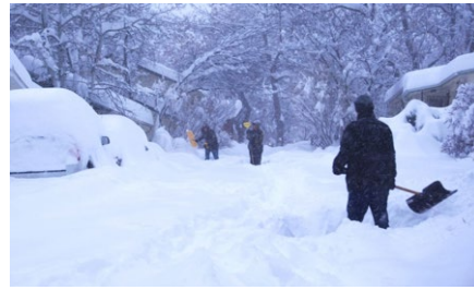
A huge snowstorm hit Colorado and much of the Midwest during the last week of November. Our Maintenance crew and several community members shoveled many hours to make the campus walkable and drivable.