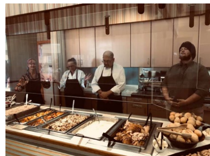
Our Thanksgiving meal, like all of our meals, receives a blessing before we dig in.