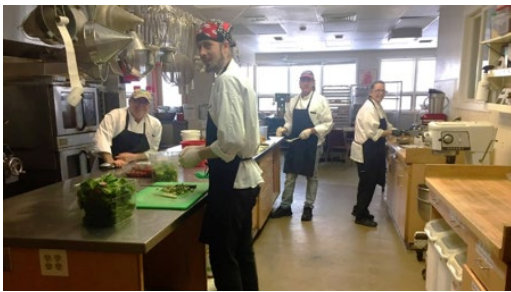
Members of the Kitchen crew pose for a photo on November 24.