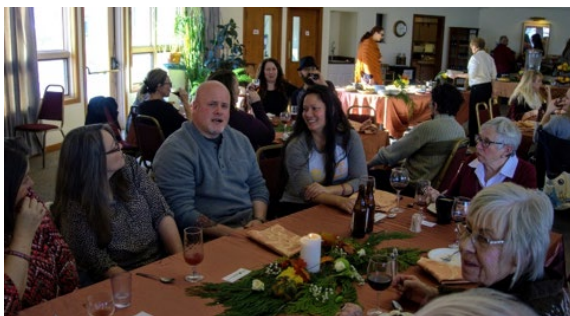
Sunrise Ranch residents and guests enjoyed a beautiful Thanksgiving dinner on November 28.