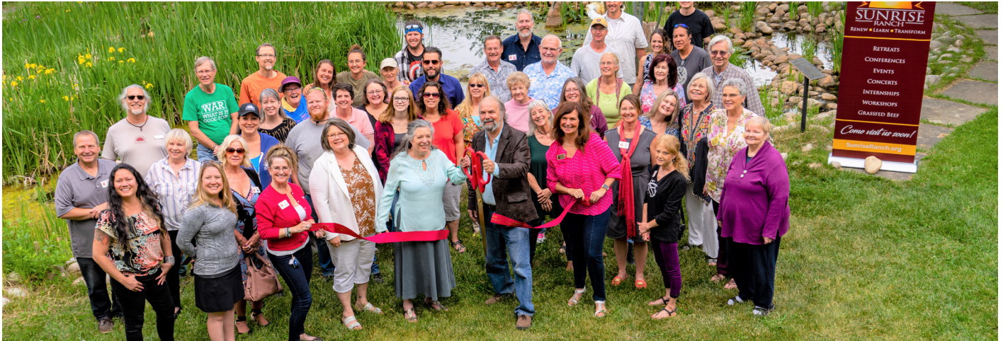
Sunrise Ranch joined the Loveland Chamber of Commerce in June and celebrated with a ribbon-cutting ceremony at the Sculpture Pond.