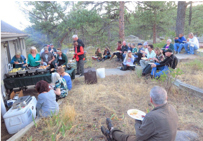
The Servers enjoyed a BBQ with the Sunrise community at the Chalet