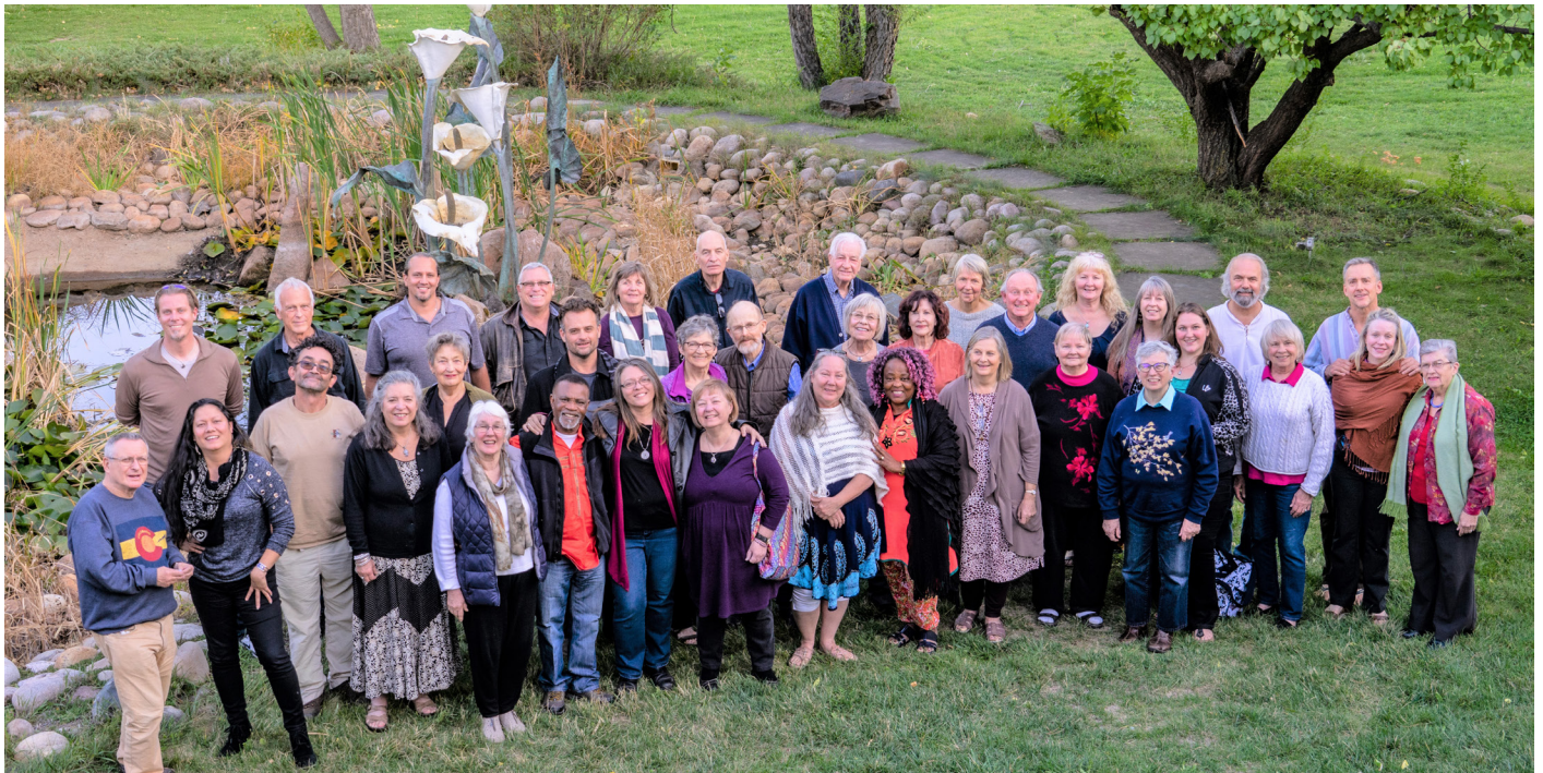
The participants of the Servers Training Intensive