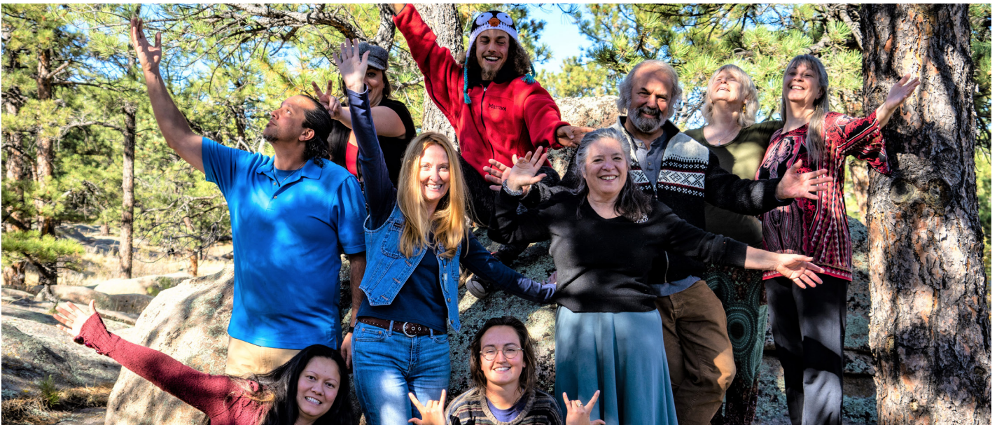
Participants of Primal Spirituality 4: Grace

For information on upcoming classes, visit primalspirituality.org