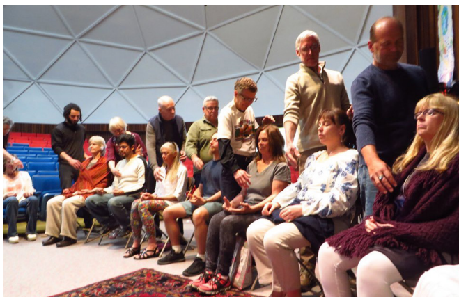
Attunement after Sunday service