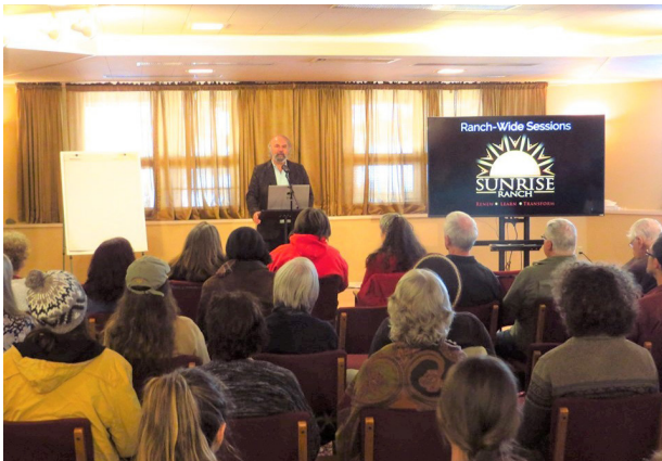
Ranch-wide Sessions are held several times each year with all Sunrise Ranch employees and residents