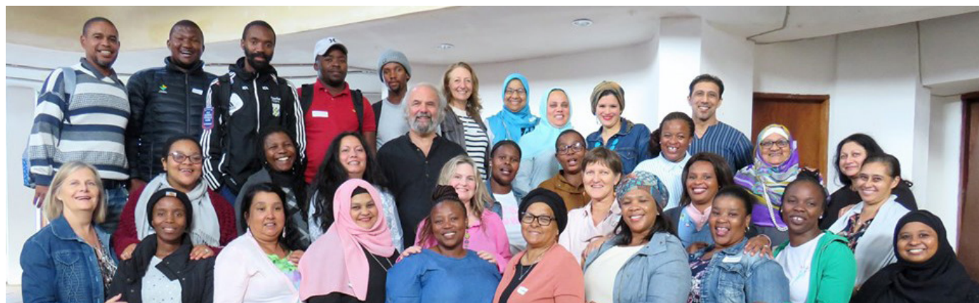
Teachers and Caregivers Empowerment at Novalis