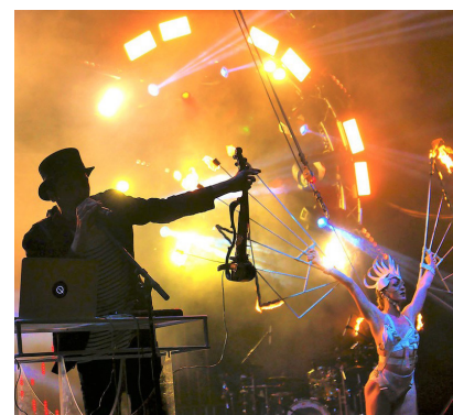
Performers on Eagle Stage at ARISE