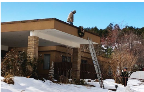
Bryan hangs a wreath from the Pavilion roof while Ashley offers support on December 7.