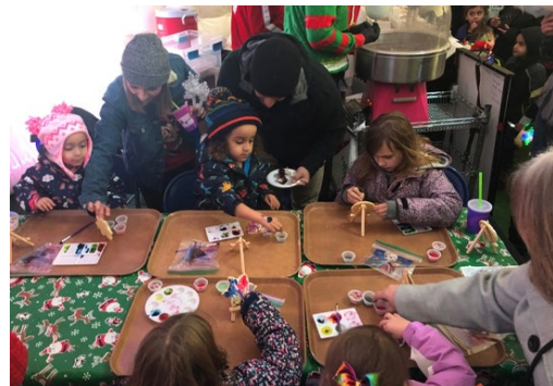
Sunrise hosted a booth during the Winter Wonderlights celebration December 13 and 14 in Loveland, offering cookie painting, chocolate fondue and hot chocolate.