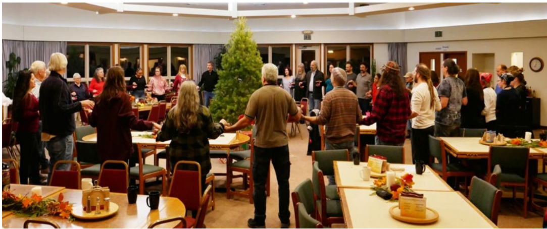
Sunrise Ranch residents gather in a circle just before decorating the Christmas tree and the Pavilion on December 4, 2019.