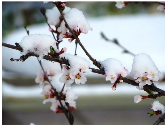
Is it spring yet? Tiny buds are appearing on branches under a light snow cover on April 12.