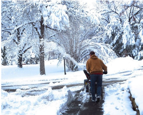
One day we're wearing shorts and tees and the next day, everything is covered with several inches of snow. Here Brian Mullen blows snow off a path on the Sunrise campus on April 16.