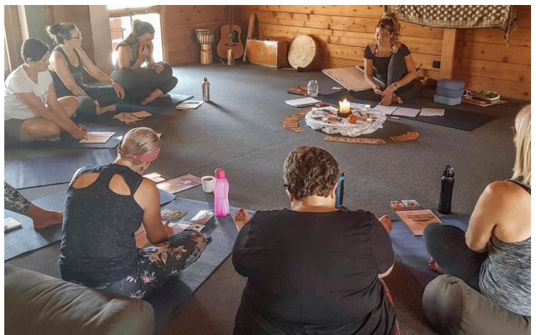
Yoga class at Riverdell before COVID-19 necessitated offering online classes