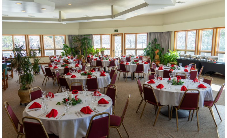
Tables set up for the Valentine's Day Lunch