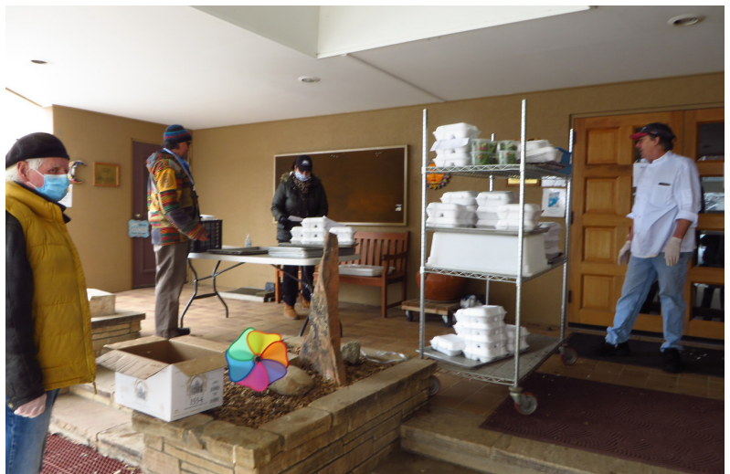
Preparing for food deliveries March - June

In addition, our amazing kitchen staff continued to prepare excellent meals and grocery orders, which community volunteers delivered to each resident on a daily basis through June. In July, we implemented a new system for enjoying meals together, under a tent behind the Pavilion. Sunrise Ranch residents continue to maintain strict social distancing measures. We consider ourselves fortunate since we are relatively isolated and have the added bonus of thousands of acres of beautiful wilderness in which to play, walk and meditate. No one can foresee how this will end but we do know that we will meet any eventuality with grace and aplomb together.