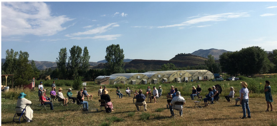
In August, the community began meeting four days a week for a morning prayer