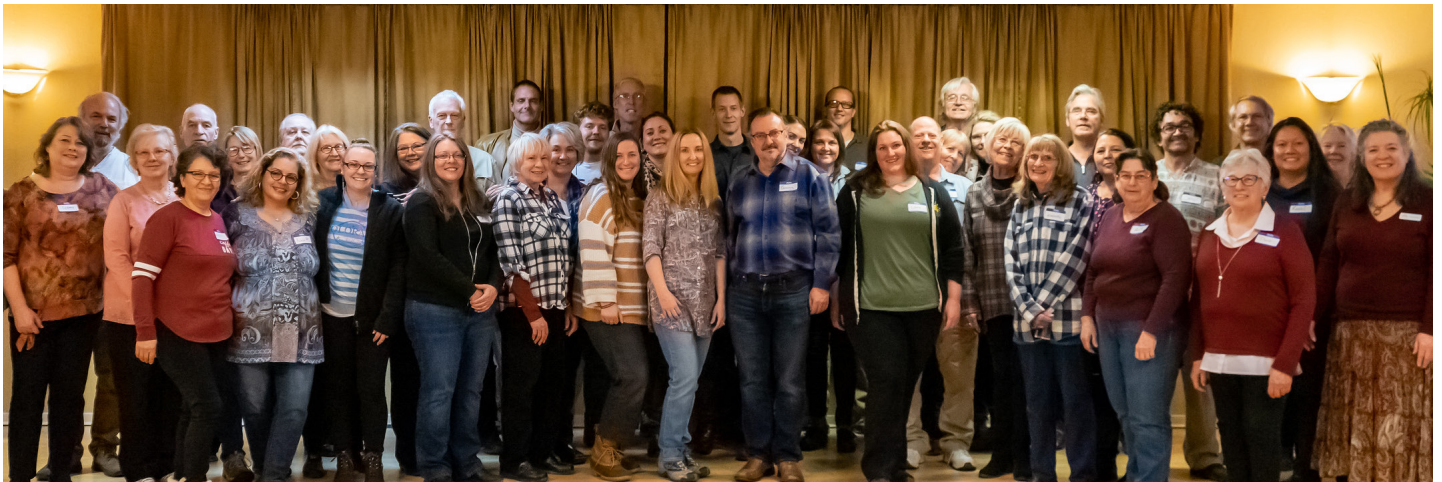
The participants in the Introduction to Attunement on February 29, 2020

We've also been developing a new website, Global Emergence, which will have an online learning platform.