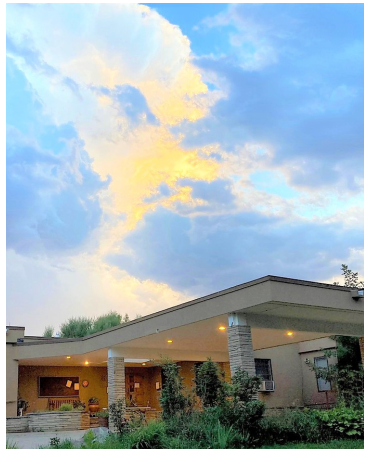
Sunrise Ranch Pavilion under a beautiful summer sky