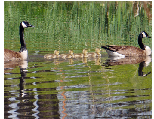
A new family joined us after the winter thaw!