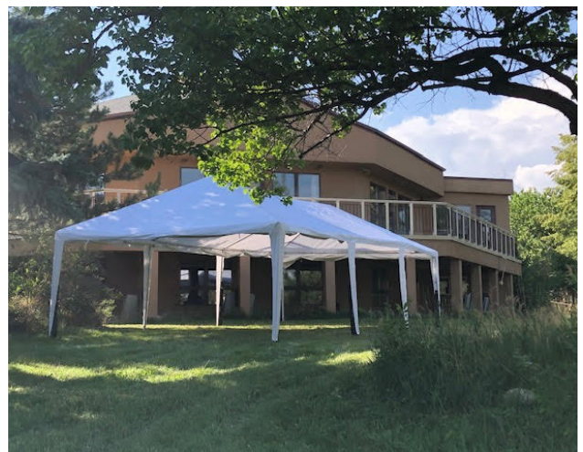
Our new meal tent behind the Pavilion