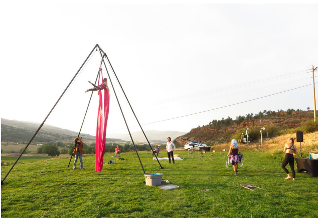
An outdoor circus party in early September was a great reprieve from the COVID-19 blues! Pictured on the right are Rachel and Phoenix Morrison.