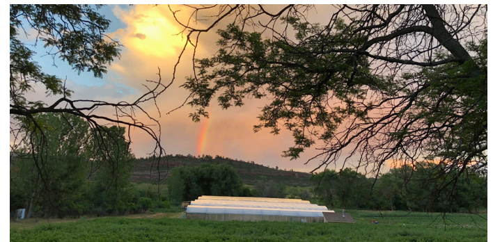
Beautiful rainbow behind our greenhouses