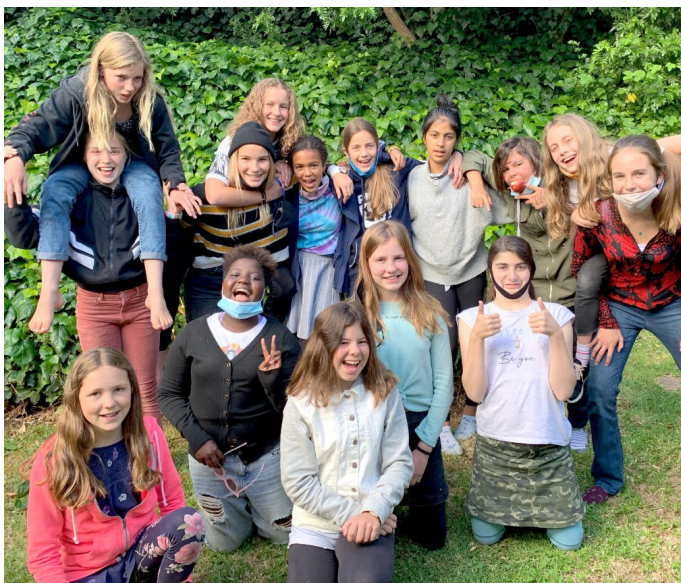
"Kids Who Can" group