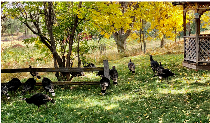
Wild turkeys visit the Ranch every autumn!