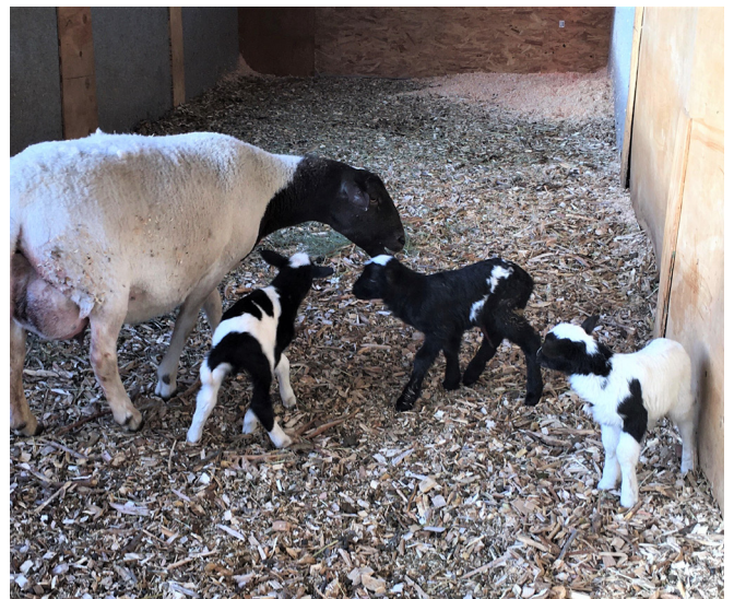
The first new lamb of the season was born December 10 and another mama gave birth to triplets on December 16!