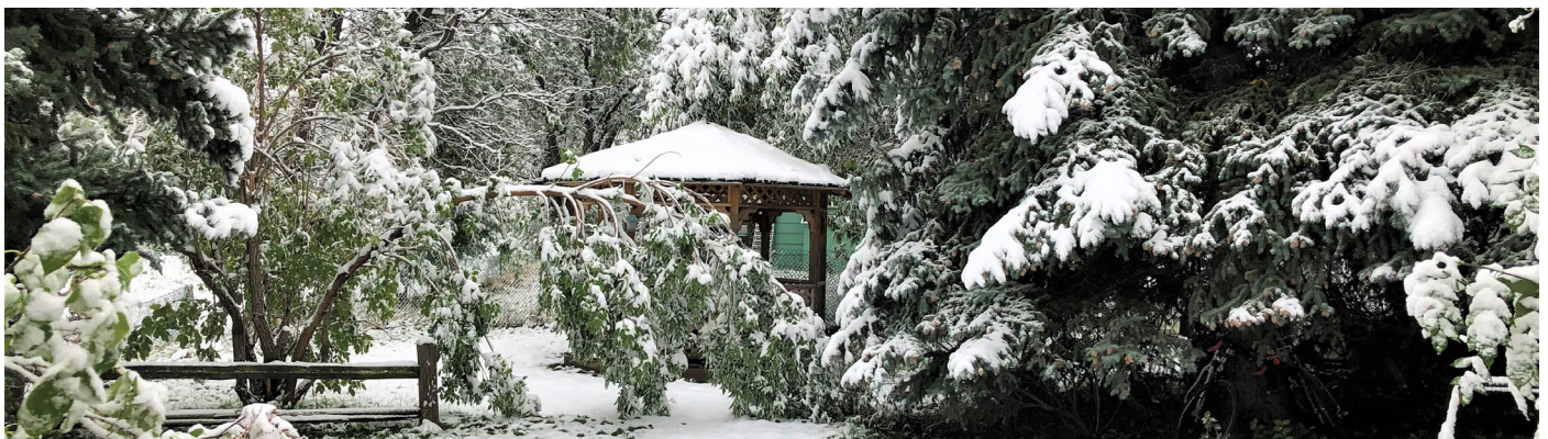
It doesn't rain often in Colorado but we get snow most any time of the year! We had a break from the snow May through August but had an early snow on September 9th this year.