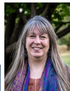
Uma Faith Sunrise Ranch