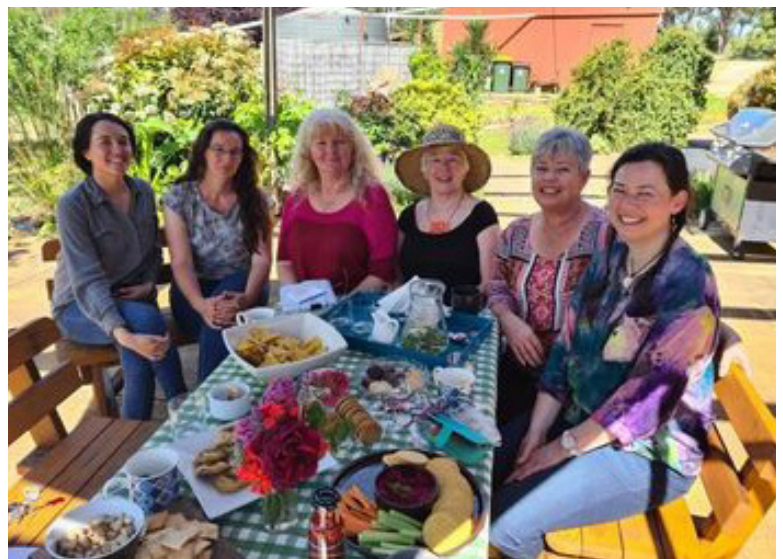
The Peace Garden crew